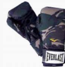
2700 : 16 oz. : CAMO