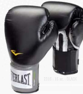
2316 : 16 oz. : BLACK