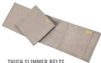
THIGH SLIMMER BELTS