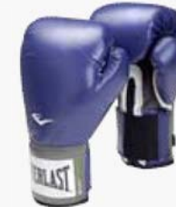
2758W: 8oz: Black Dahlia