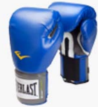
2216 : 16 oz. : BLUE