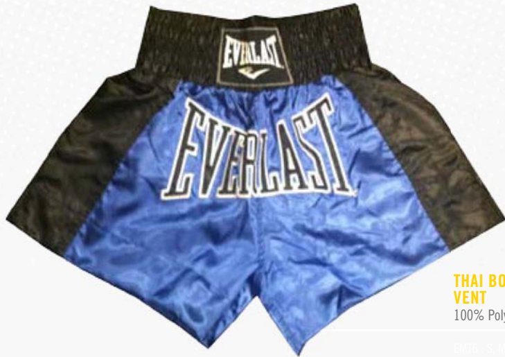
THAI BOXING SHORT WITH SIDE VENT 100% Polyester satin

EM6 : S, M, L, XL: Black EM6 : S, M, L, XL: Blue/black