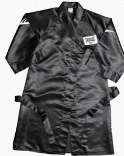
FULL LENGTH BOXING ROBE 100% polyester satin.

EM6 : S, M, L, XL: Black EM6 : S, M, L, XL: Blue/black